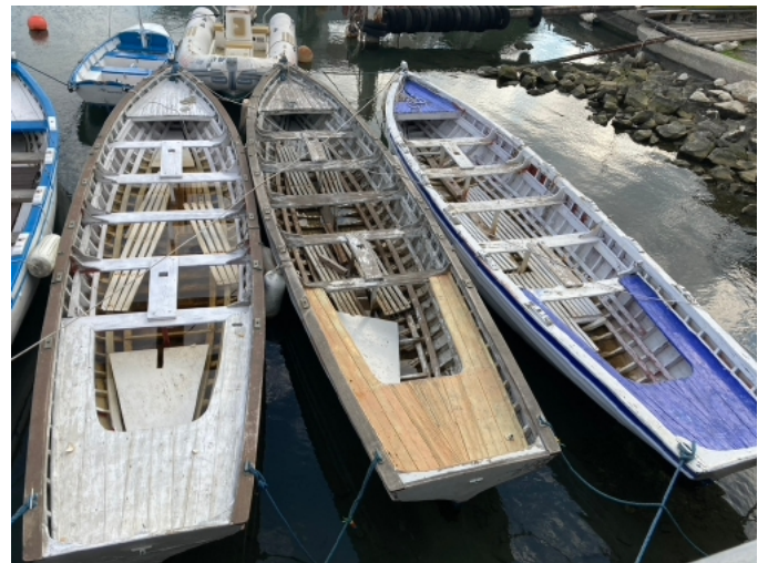
Figure 5: Traditional Mediterranean vessels, Larnaca.