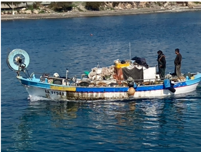
Figure 2: Fishing boat heading out.