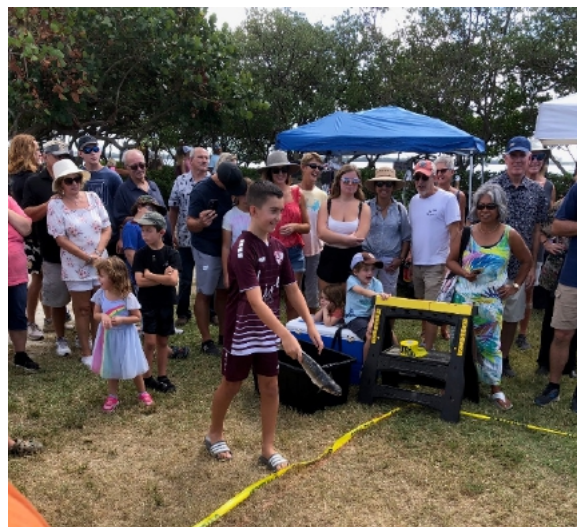
Figure 6: Mullet Toss at the Mullet Smoke-off.