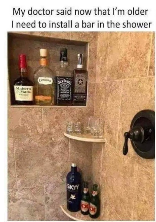
Figure 10: As seen on the Internet. Author unknown.