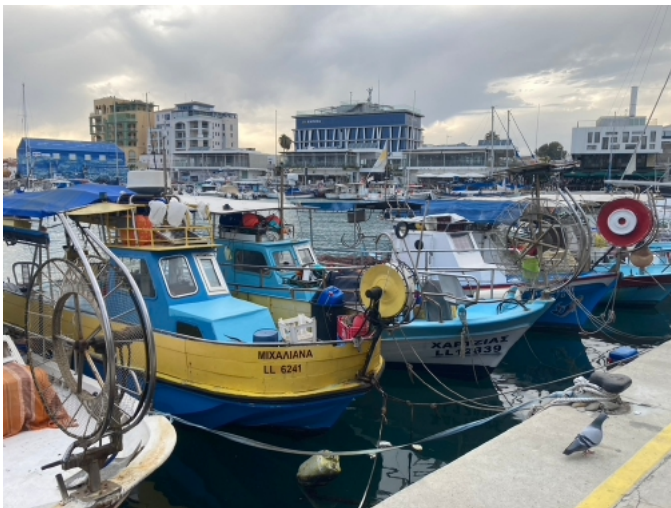
Figure 3: Fishing Boat dock in Zygi.