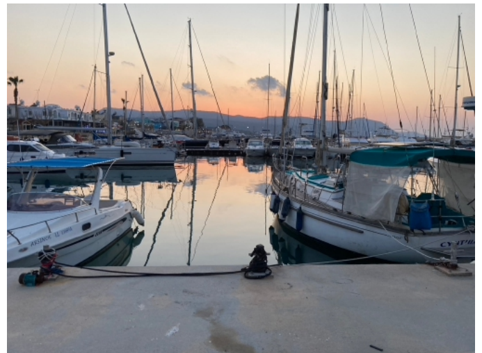
Figure 4: Sunset in yacht basin Limassol.