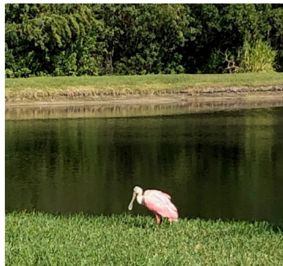
Figure 7: Roseate Spoonbill in the backyard.